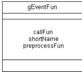
Figure 6: The gEventFun Class.

the preprocessFun slot is a list of all preprocessing functions that must be called before the callback function.