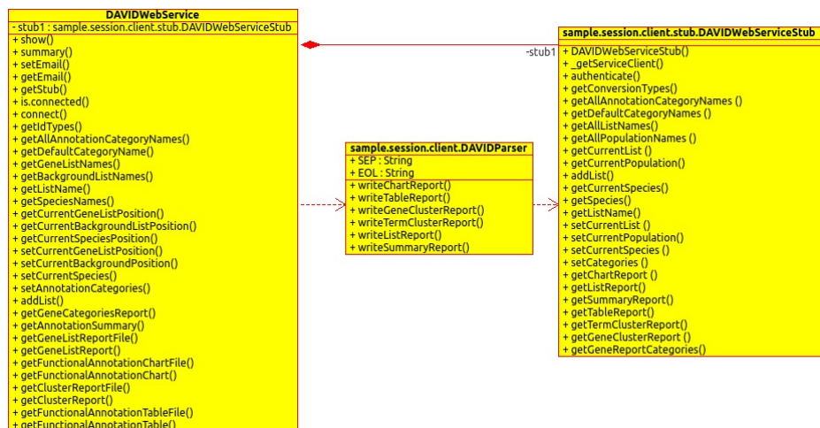
Figure 1: R-to-Java class diagram. RDAVIDWebService uses rJava to access/control DAVID web service through RDAVIDWebServiceStub and parse the reports back to R by DAVIDParser . Note that operation signatures have been omitted for simplicity.

The package implements RDAVIDWebService , a reference class object by means of R5 paradigm, for DWS communication through a Java client ( RDAVIDWebServiceStub ). This allows the establishment of a unique user access point (see Figure 1).