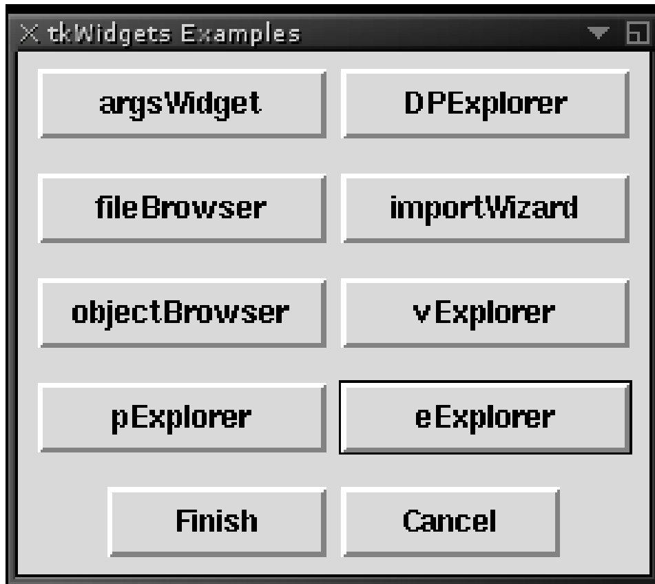
Figure 1: A snapshot of the widget when the example code chunk is executed