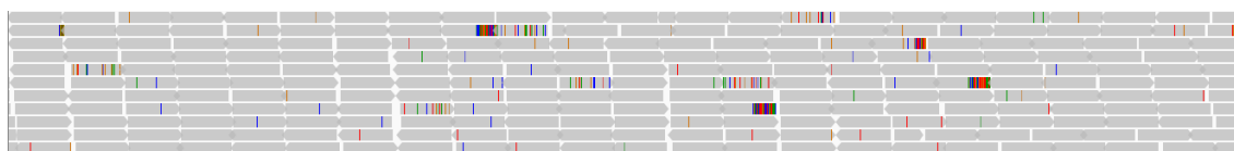
Figure 3: Simulated reads mapped in proper pair. Mismatches and soft-clips are shown as colored vertical lines in reads.